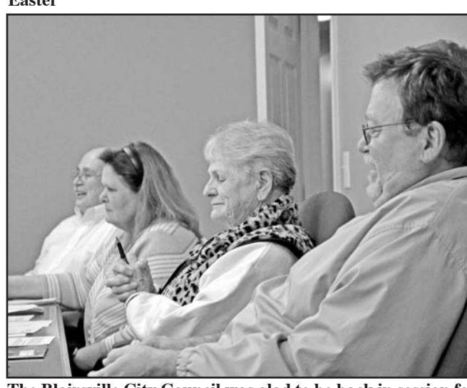
The Blairsville City Council was glad to be back in session for

this time, and all alcohol has been removed from the store until both the fine is paid and a new managing agent is determined. Also during the meeting,